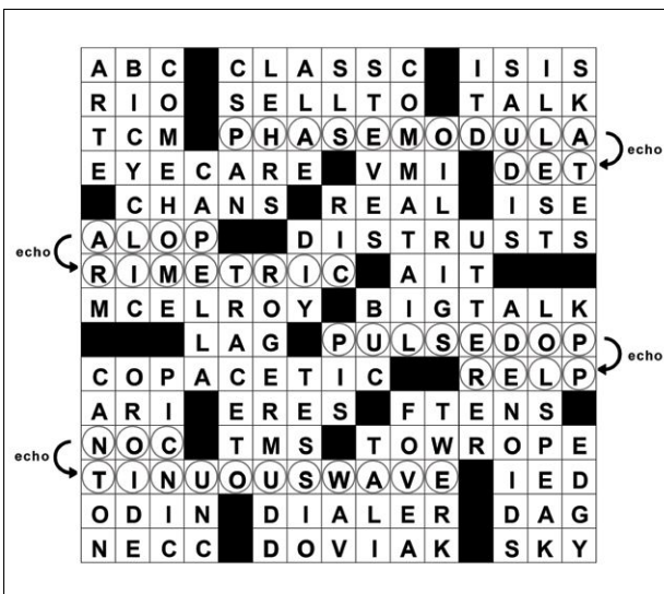
Answers to the puzzle on page 1003.