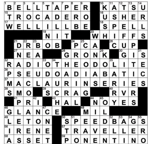
Answers to the puzzle on page 710.